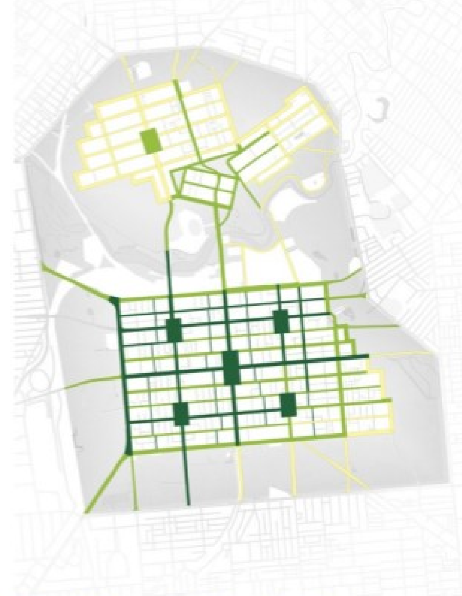
Figure 4.3 Diagram of the Green City Grid