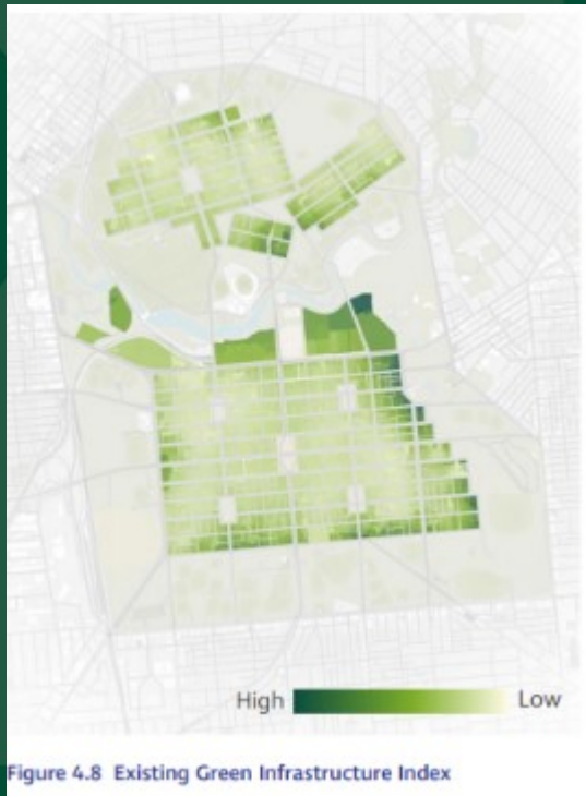
Figure 4.8 Existing Green Infrastructure Index

The Adelaide Park Lands and the City Squares will be places for active and passive recreation and social engagement with a mix of urban uses around the Squares.