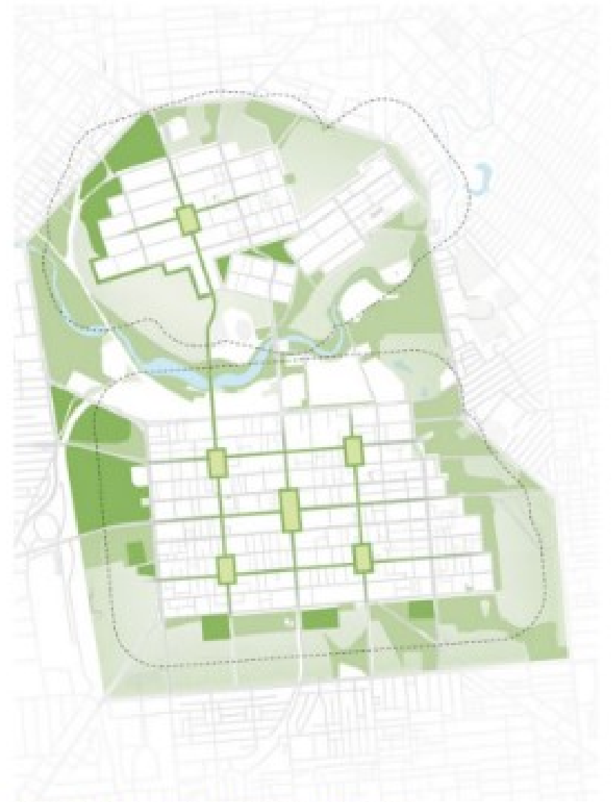
Figure 4.7 Diagram of Square Activation