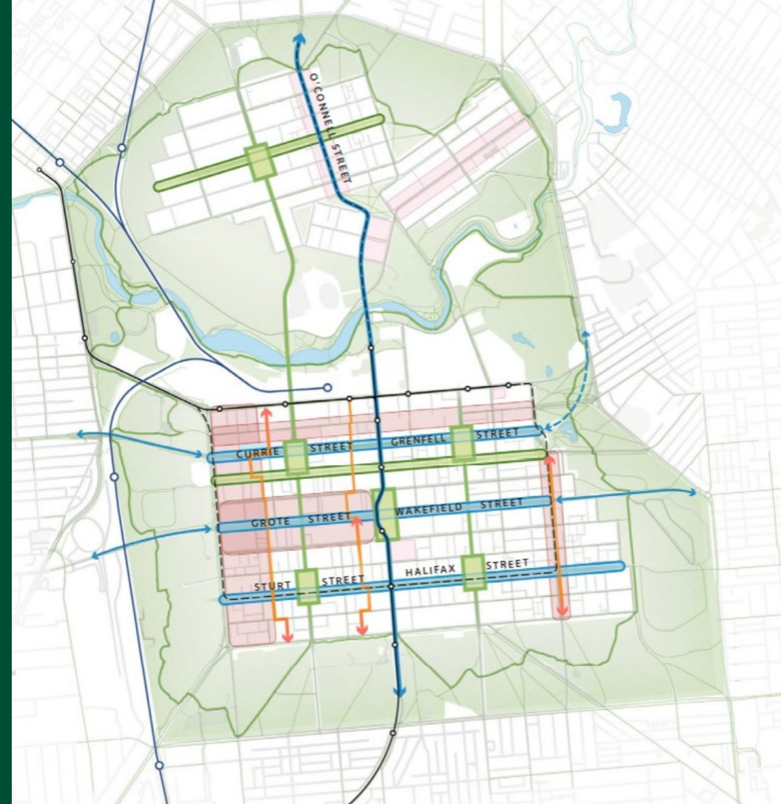
Figure 4.2 Overview of City Wide Strategies